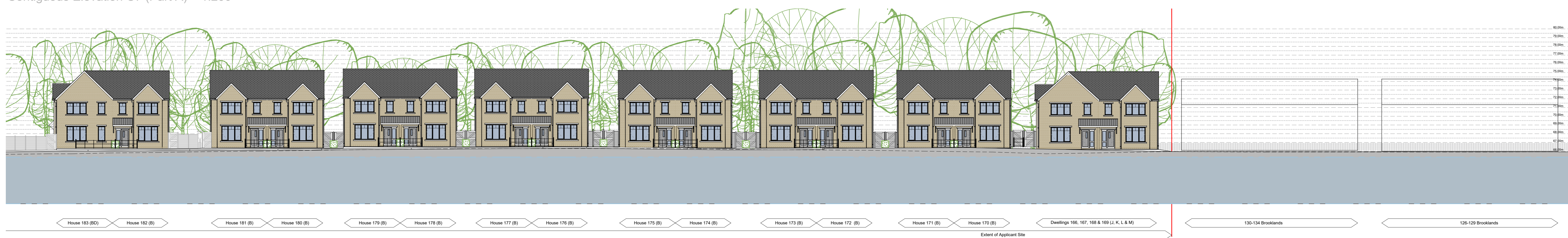
Contiguous Elevation C7 (Part B) 1:200