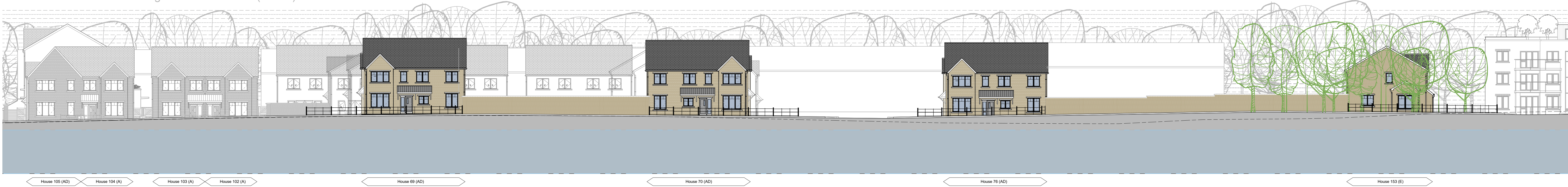
Contiguous Elevation C5 (Part B) 1:200