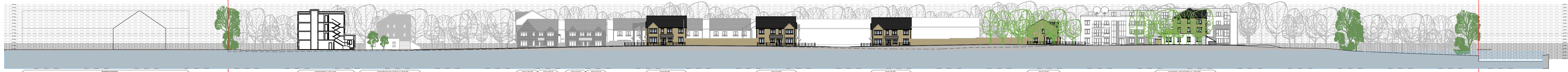
Contiguous Elevation C5 1:500