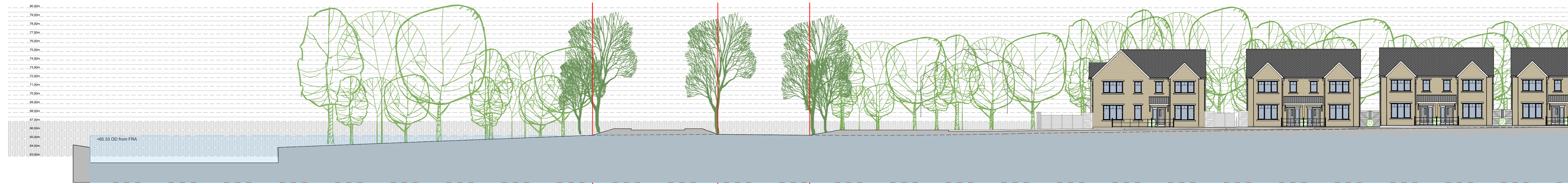
Contiguous Elevation C7 (Part A) 1:200