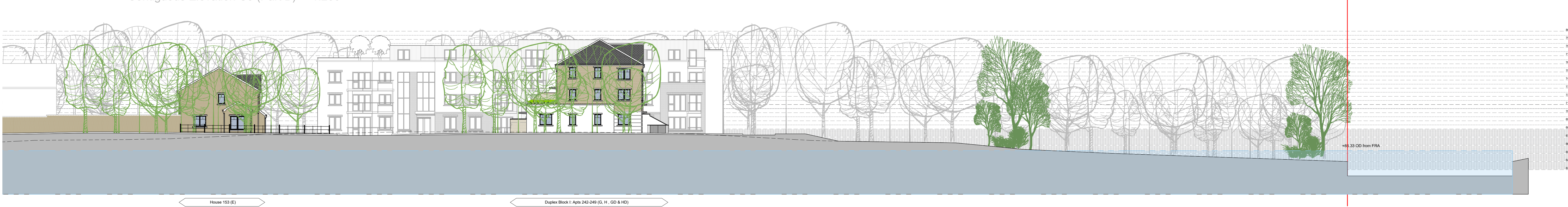
Contiguous Elevation C5 (Part C) 1:200