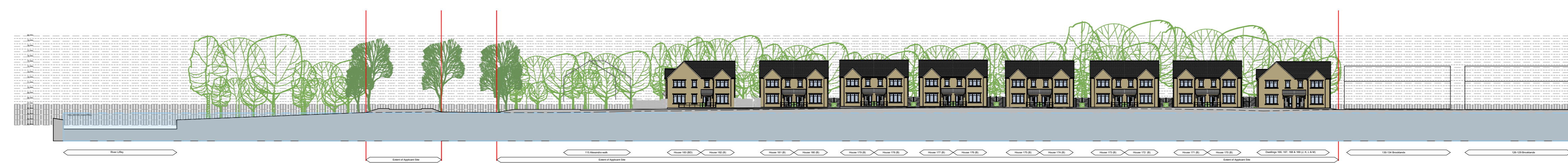
Contiguous Elevation C7 1:500